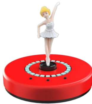
Figure 1. CLOQ Magical Music Box

Thank you for choosing CLOQ! This manual will help you understand the functions and operation of CLOQ Magical Music Box!